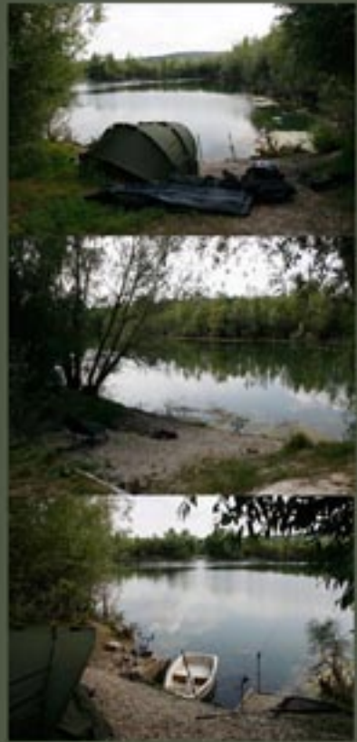
Etangs de la Croix Blanche